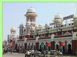
CHARBAGH RAILWAY STATION