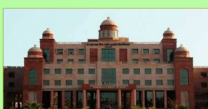
DR. SHAKUNTALA MISHRA REHABILITATION UNIVERSITY