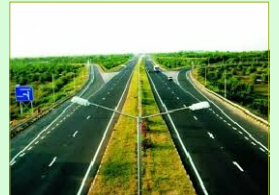
AGRA X-PRESS WAY